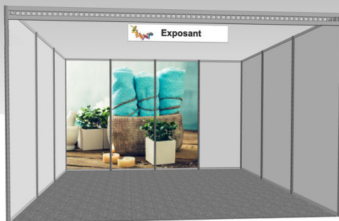
IMAGE 2 / printed textile