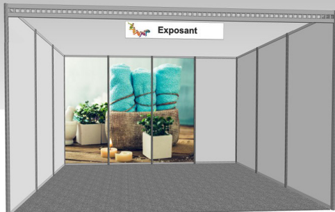
IMAGE 2 / print op peesdoek